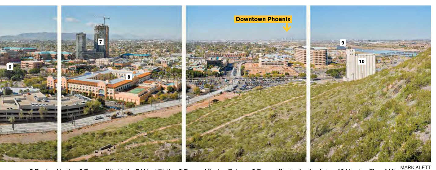
5 Design North 6 Tempe City Hall 7 West Sixth 8 Tempe Mission Palms 9 Tempe Center for the Arts 10 Hayden Flour Mill