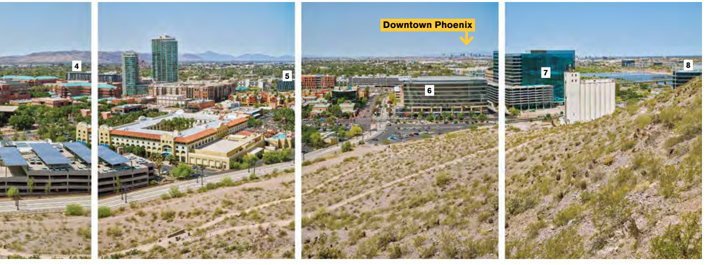
4 The Local, Whole Foods Market 5 The Beam on Farmer 6 222 S. Mill Avenue 7 100 S. Mill Avenue 8 Hayden Ferry Lakeside