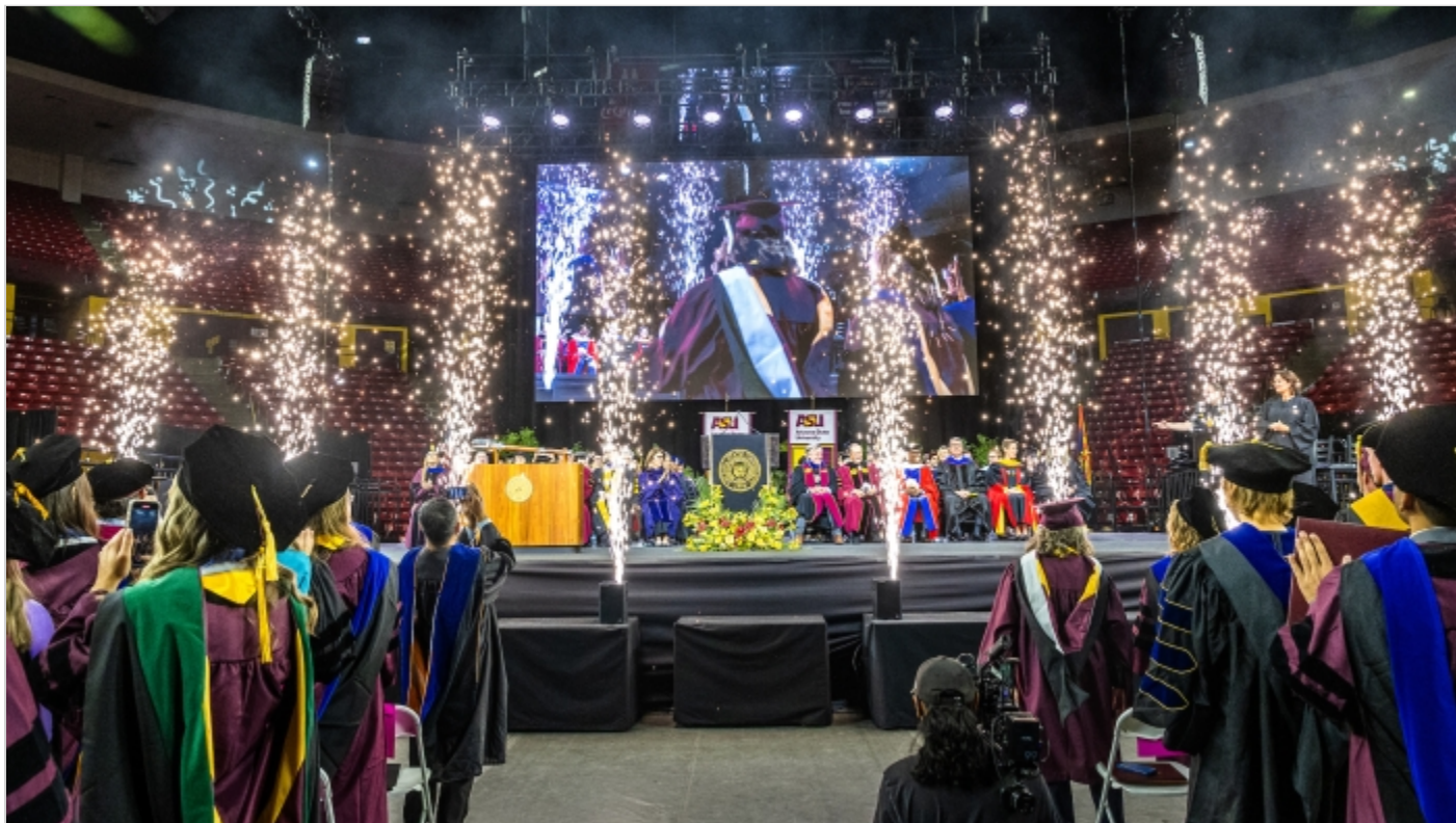
Sparks fly at the end of the fall 2025 Graduate Commencement at Desert Financial Arena.