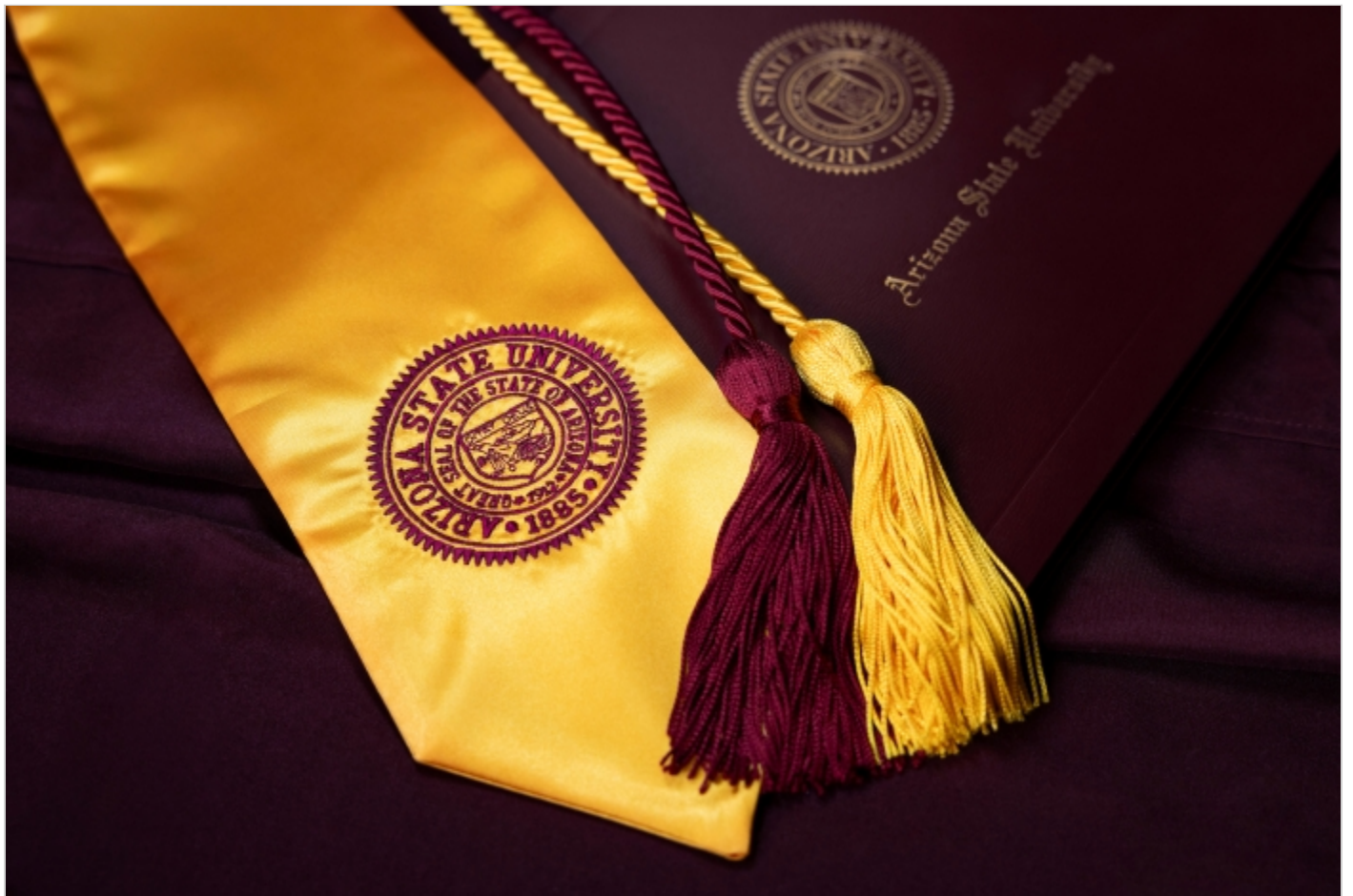
Photo of ASU graduation regalia