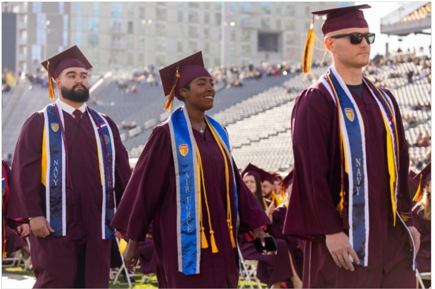
Veterans walk in the processional during undergraduate commencement at Mountain America Stadium in Tempe on Dec. 16, 2024.